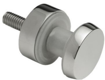
CC - 768