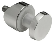
CC - 769