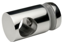
CC - 790