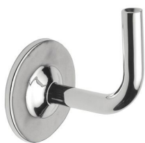
ST - 350