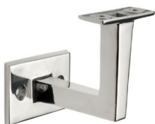
ST - 335