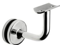
ST - 314