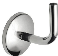
ST - 352