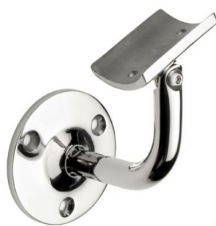
SA - 410