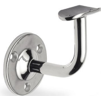
ST - 303