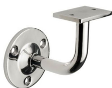
ST - 316