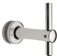
SA - 423 (BF - 00)