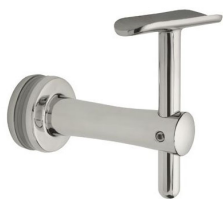
SA - 423 (BF - R)