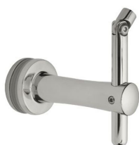
SA - 423 (BG - 00)